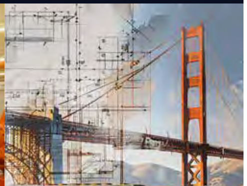
ENGINEERING & INFRASTRUCTURE