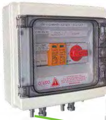
COMBINER BOX WITH 2 IN & 1 OUT