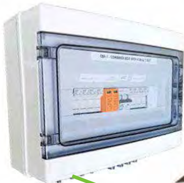
COMBINER BOX WITH 4 IN & 1 OUT