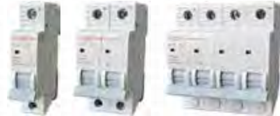
DC POLE CIRCUIT BREAKERS