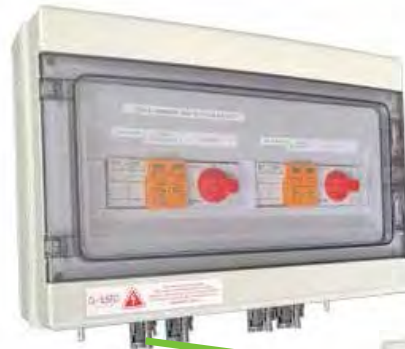
COMBINER BOX WITH 2 IN & 2 OUT