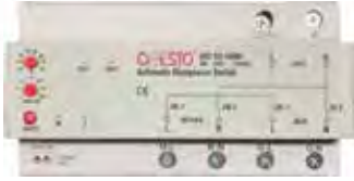
AUTOMATIC CHANGE OVER SWITCH

For backup power systems, hybrid inverters, battery storage, and renewable energy infrastructure, please refer to the Kanamoza Energy Solutions Catalogue.