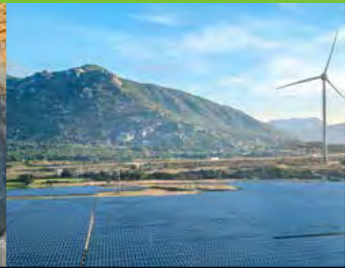
ENERGY & UTILITIES