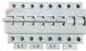
CHANGE OVER SWITCH