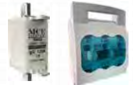
SOLAR BATTERY FUSE, WITH DISCONNECTOR